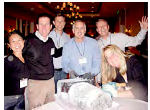
Bio execs pose with their one-of-a-kind ice sculpture.

The "winning ice sculpture" adorned the main buffet table for the evening's dinner event, making the creators the masters of the ice!